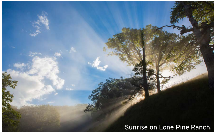
Sunrise on Lone Pine Ranch.

Colorado's 52,896-acre Cross Mountain Ranch, Northern California's 26,601-acre Lone Pine Ranch, and the 157-acre Mountain of Beverly Hills have all undergone price reductions in recent weeks. But the 69 percent markdown associated with the former Santa Ynez estate of Michael Jackson ranks as the largest percentage decrease of all. Originally listed for $100 million in 2015, the King